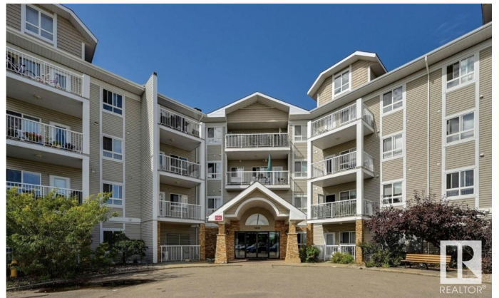
328-5350 199 St NW, Edmonton, AB Main Floor Interior Area 865.52 sq ft