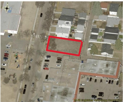
9115 143 St-Location